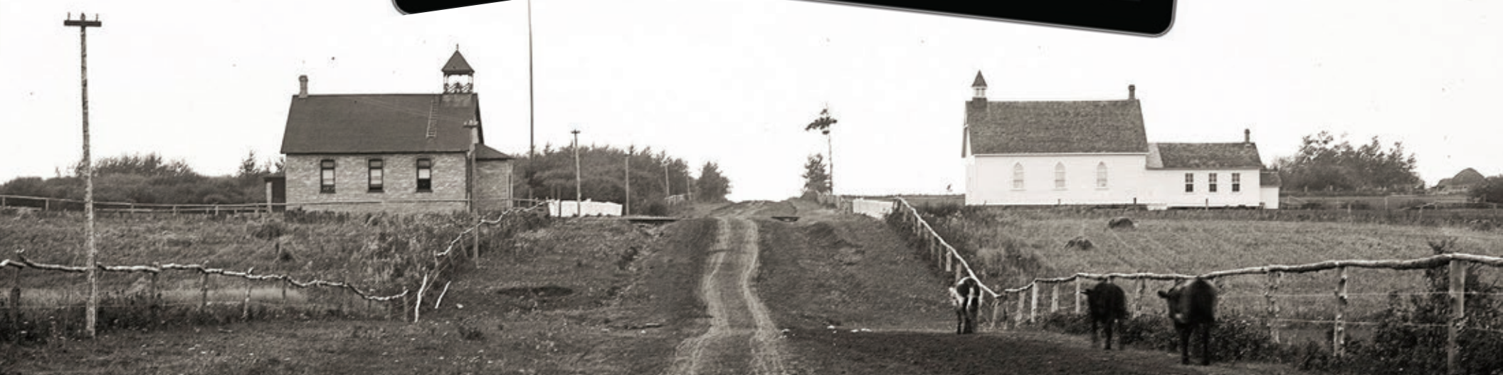
Church and school at Clover Bar