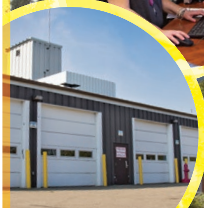
South Contact Office