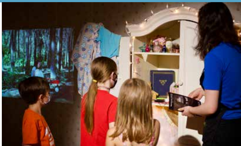
Program participants explore Leda (2019) by Tammy Salzl from Tales from the In Between at Gallery@501