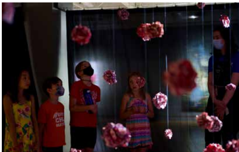
Program participants explore Threnodies (2019) by Tammy Salzl from Tales from the In Between at Gallery@501