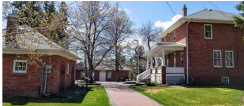
Smeltzer House Visual Arts Centre

501 Festival Avenue, Sherwood Park, AB T8A 4X3 Located in the Community Centre strathcona.ca/gallery501