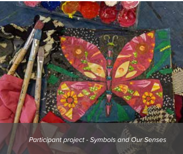
Participant project - Symbols and Our Senses