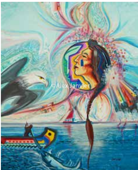
"Blue Quills Scar", 1991, oil on canvas

Curriculum connections: Social Studies Grade 4 The Stories, Histories and Peoples of Alberta, Alberta: Celebrations and Challenges; Grade 5: Canada: Shaping an Identity; First Nations history and current events.