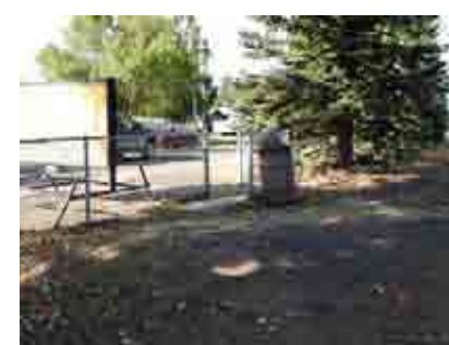
Problematic Park Entrance Hindering Accessibility