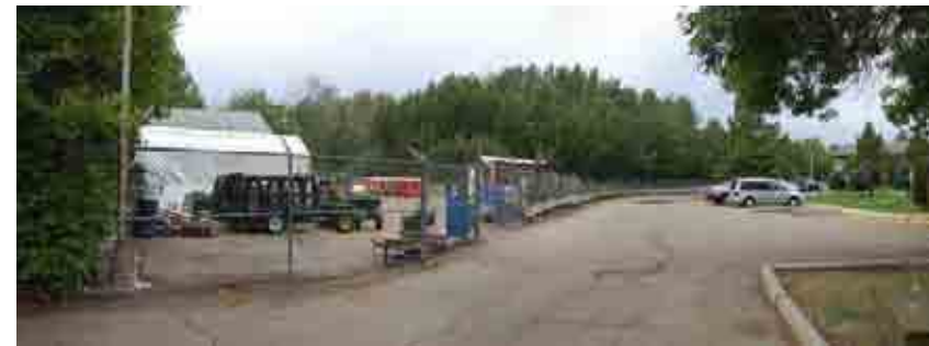
Storage Yard in Townhouse Complex