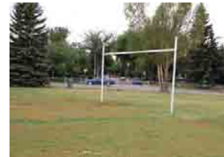
Existing Football Practice Equipment