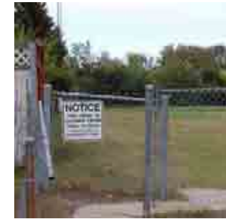
Existing Entry Fence Condition