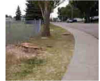
Existing Park Perimeter Fence Condition