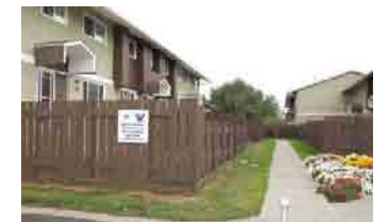
Pathway to Park in Townhouse Complex