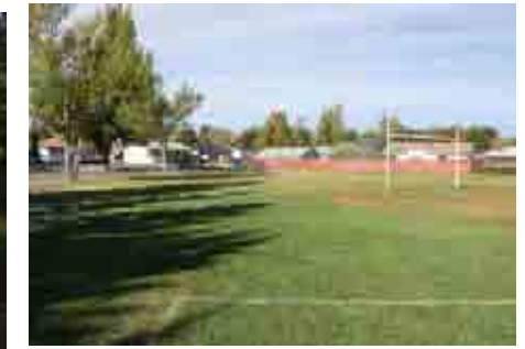
Park Irrigation by Volunteers