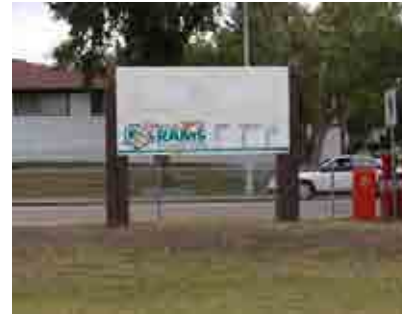
Back Side of Park Sign