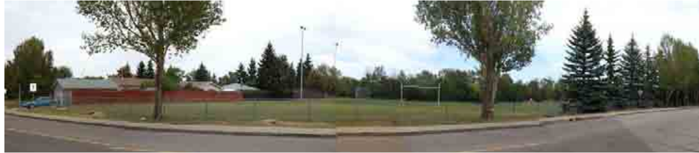
Westboro/Kinsmen Park at Strathcona Drive Frontage