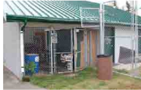
Rams Football Club Storage