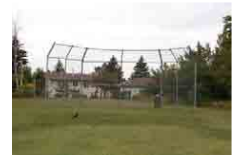
Existing Ball diamond Back Stop Condition