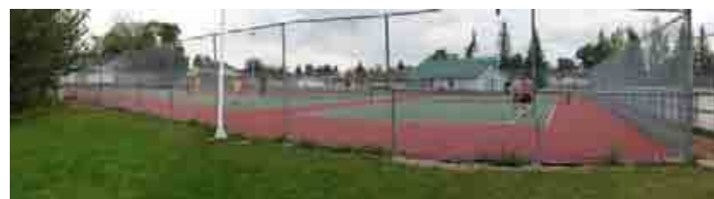
Existing Tennis Courts