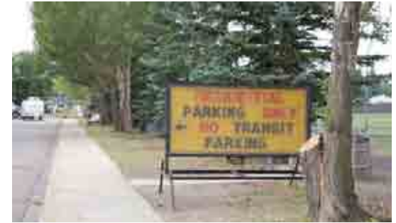
Sign Showing Parking Concerns