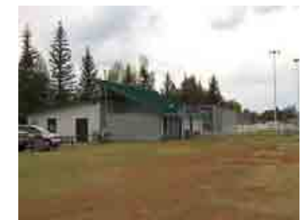
Rams Football Club Building