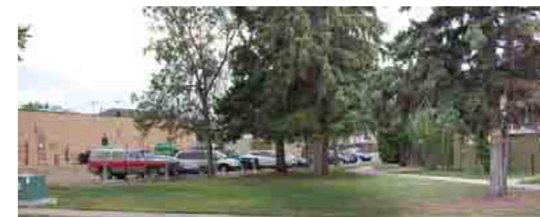
Pedestrian Short-cut from Westboro Elementary School to Westboro Park