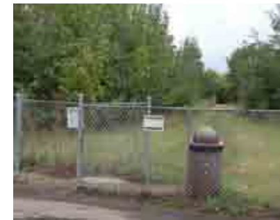
Entrance to Park at Townhouse Complex