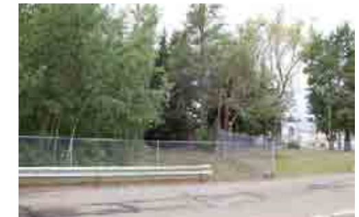
Interface Between Wood Lot at Northwest of Park