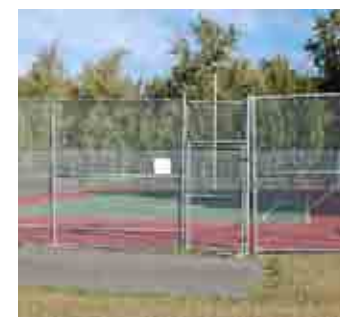
Damaged Tennis Court Fencing