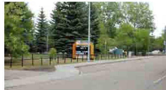
Westboro Elementary School to the North of Park