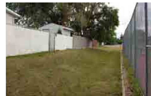
Area Between Tennis Courts and Adjacent Residences