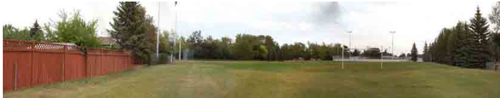
Interface of Park and Adjacent Neighbour to the West