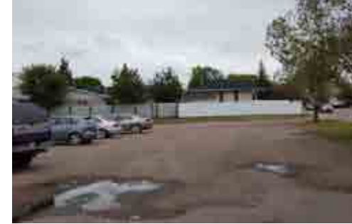
Parking Area near Adjacent Residences