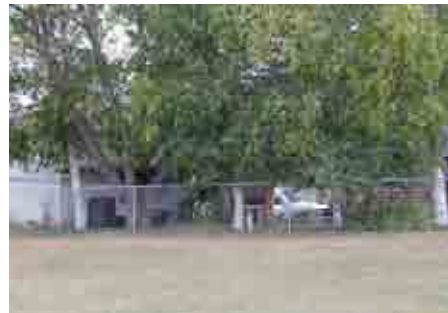
Interface of Park and Adjacent Neighbour to the West near the Wood Lot