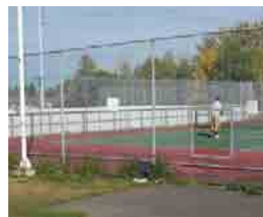
Tennis Court "Entrance"