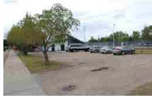
Parking Area Near the Activities Area