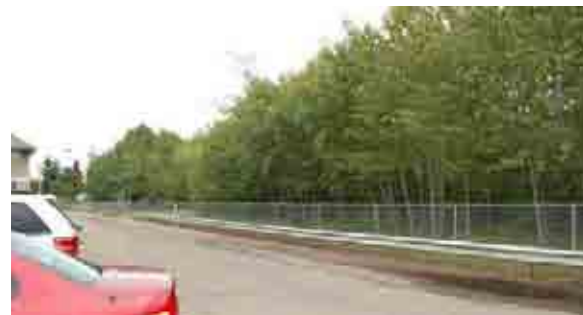
Townhouse Complex and Park Wood lot Interface