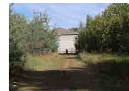
Hidden Entrance from Townhouse Complex