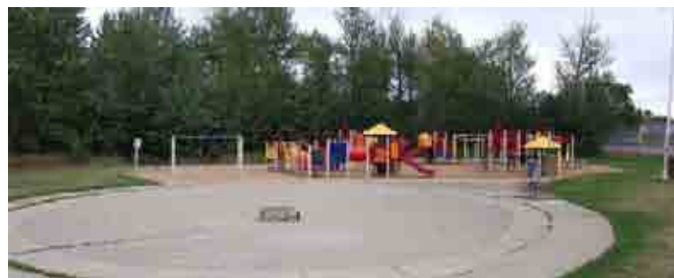
Existing Playground and Spray Deck