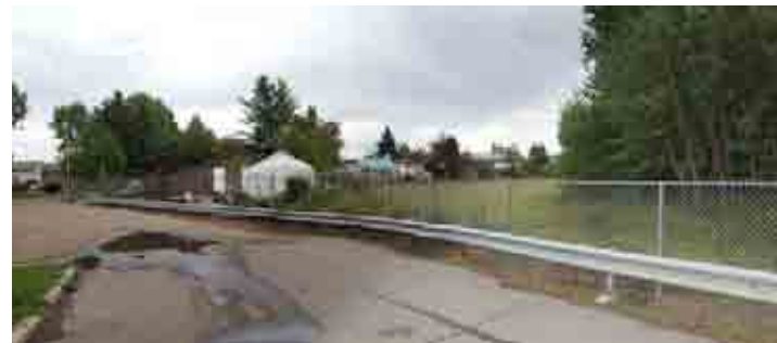
View of Park From Townhouse Complex to the North