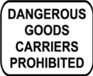
RB – 70T 30 x 30 cm