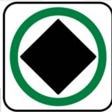
RB – 69 60 x 60 cm

"DANGEROUS GOODS ROUTE" signs shall have a green circle circumscribing a black diamond symbol on a white background.