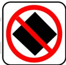
RB – 70 60 x 60 cm

“DANGEROUS GOODS PROHIBITION” signs shall have a red circle circumscribing a black diamond symbol on a white background with a red diagonal superimposed over the diamond symbol. Where the sign is erected, Dangerous Goods carriers are prohibited from travelling upon the street or Highway.