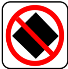
RB – 70 60 x 60 cm

“DANGEROUS GOODS PROHIBITION” signs shall have a red circle circumscribing a black diamond symbol on a white background with a red diagonal superimposed over the diamond symbol. Where the sign is erected, Dangerous Goods carriers are prohibited from travelling upon the street or Highway.