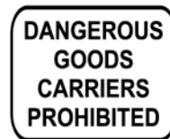
RB – 70T 30 x 30 cm