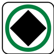
RB – 69 60 x 60 cm

"DANGEROUS GOODS ROUTE" signs shall have a green circle circumscribing a black diamond symbol on a white background.