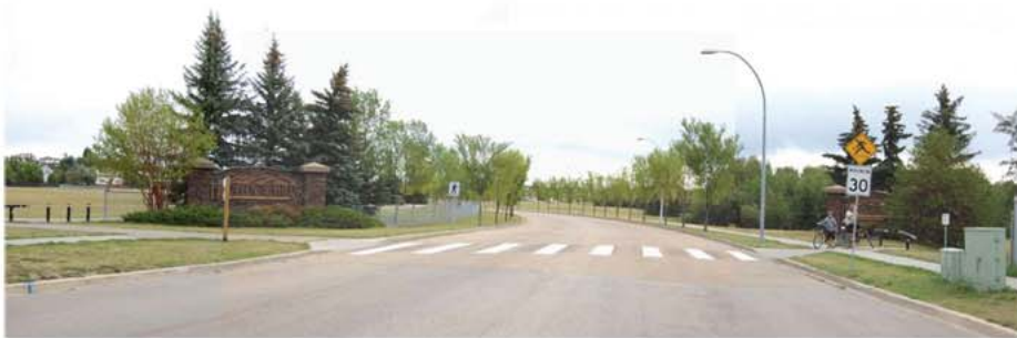
E. Western park entry and roadway crossing.