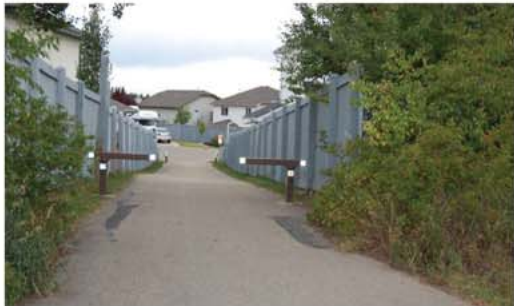
H. Park access connection.