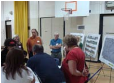
Brentwood Park Visioning Workshop

Opportunities for community input into this master planning process included a series of community visioning workshops prior to the preparation of preliminary park revitalization plans, as well as a series of follow-up open houses to review the preliminary plans and provide input prior to the preparation of the final master plan.