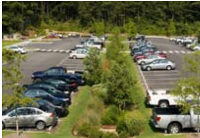
As an element of ‘green infrastructure’, a bioswale mitigates issues related to stormwater rates and quality

deck provides an opportunity for parents to relax and visit with neighbours while their children play.