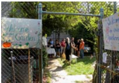
Whether intended or not, parks and open spaces are a venue in which the life of a community plays out

Preserving environmental integrity and ecological function is increasingly becoming a basic requirement of park planning in municipal settings. In addition, there is an opportunity to celebrate nature as part of an experience combining leisure and education.