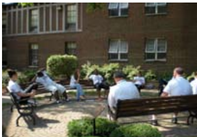
Active spaces tend to be safe places