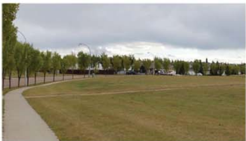
C. Large informal open space south of Heritage Drive.