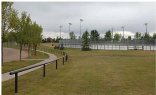
D. Boarded rink.