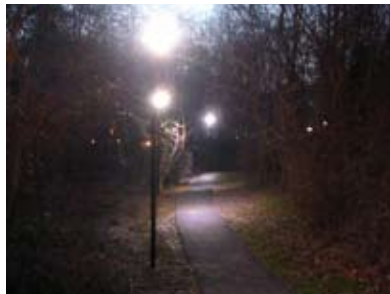
Facilities planned for evening use should be lit