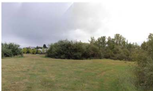
K. Natural area south of Heritage Drive.