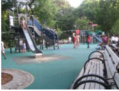
Benches and landscaping make for a pleasant place to watch children and visit with other parents