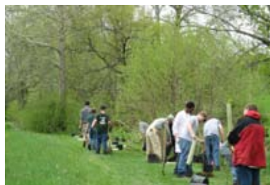
Community clean-up effort