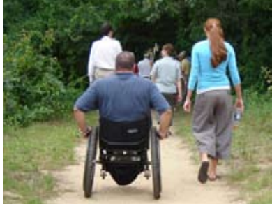
Accessible parks and open spaces are a fundamental priority