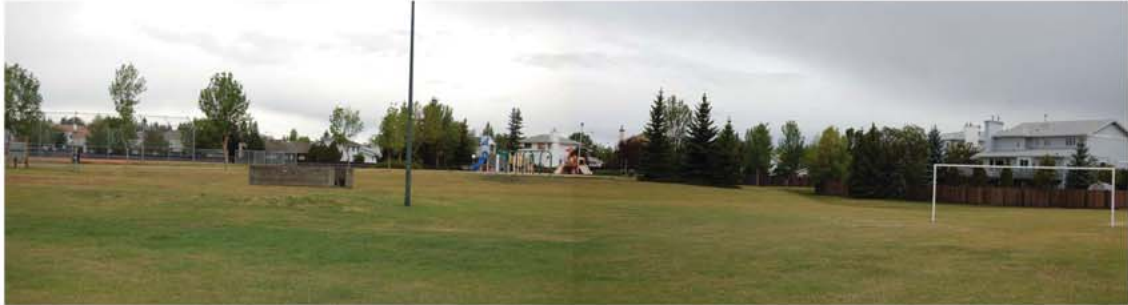
G. Informal open space east of boarded rink, typically used for football practice in fall and leisure skating in winter. Note baseball diamond and playground in background.