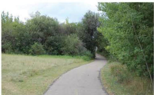
B. Typical asphalt trail.