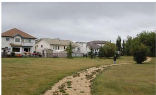
A. Typical gravel trail, illustrating maintenance concern. Note also interface with adjacent residential area.