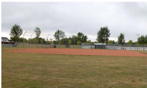
J. Baseball diamond with shale infield.