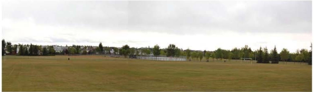
F. Main playing field area with boarded rink in background.