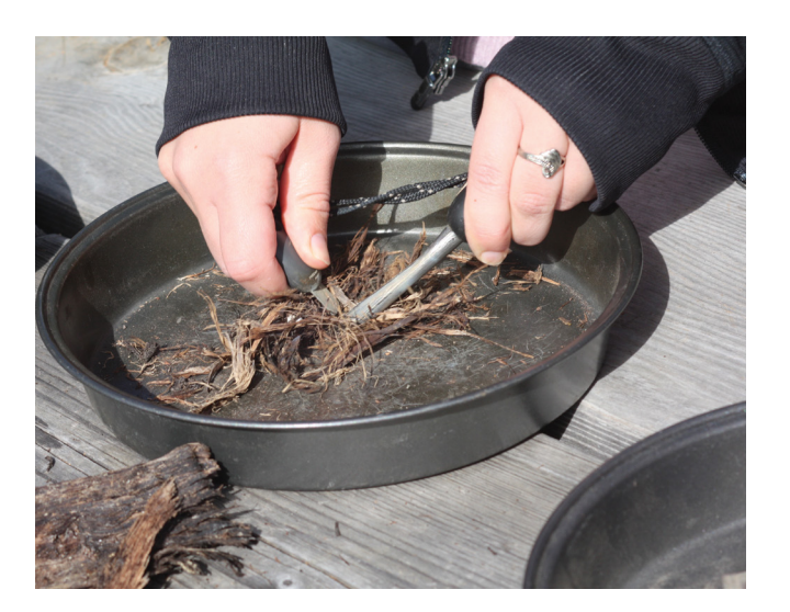
Nature Awareness/Outdoor Skills/Spring break