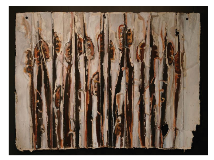
"The Growth of Privilege Reaches the Point of Prejudice" by Paddy Lamb