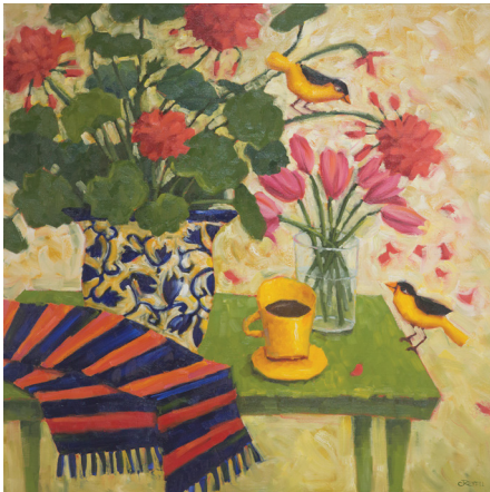
Conversations at Noon by Cindy Revell, 2019