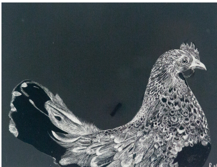
Chicken Scratch by Remy McGlashan, 2019