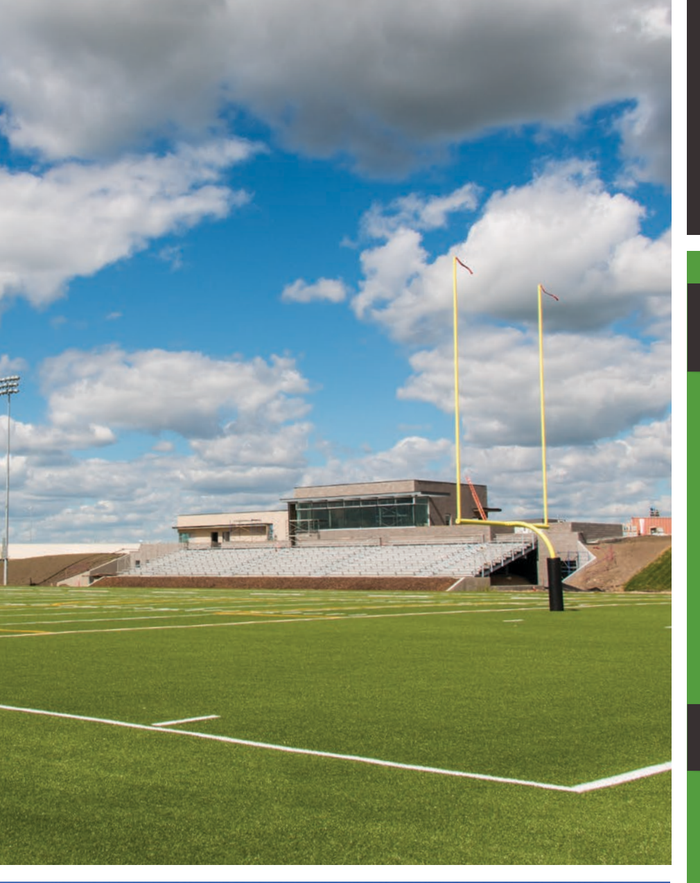
Full Pavilion Sponsorship Details Available on Page 6