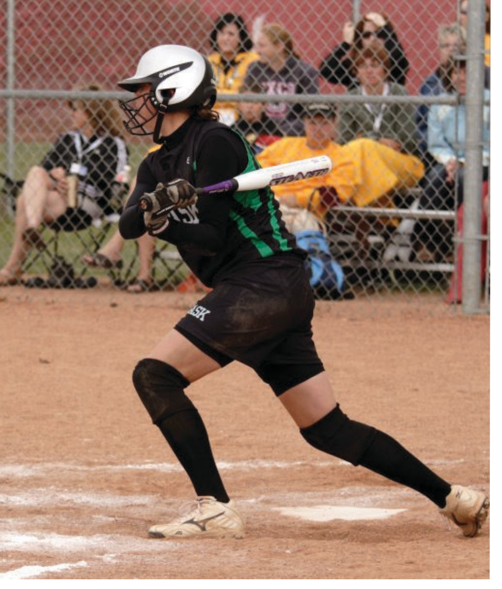
Full Ball Diamond and Field Sponsorship Details Available on Page 7