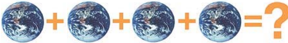
Figure 11: Four Planet Living

Traditionally, Strathcona County has assumed growth and development with limited consideration for the long-term negative social, environmental or economic impacts on the community. Our present form of development, as well as our lifestyle choices means that Strathcona County residents, along with the rest of the world, are consuming resources at a faster rate than the planet can replenish them. This is causing world wide issues such as disappearing forests, declining fisheries and climate change. In fact, if everyone in the world lived as we do in Strathcona County, we would require four planets to support us, as depicted in Figure 11. The challenge that faces us all is how can we continue to enjoy the current quality of life and standard of living we presently have, within the carrying capacity of one planet?