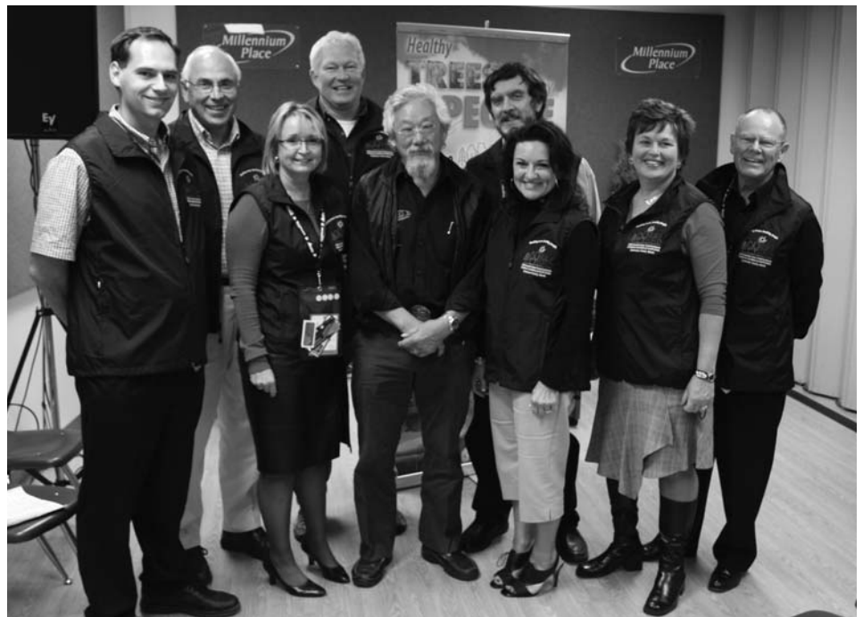
David Suzuki, keynote speaker at the successful 2008 Canadian Urban Forest Conference hosted by Strathcona County and Tree Canada in September at Millennium Place, is welcomed by members of Council.

The Canadian Urban Forest Conference itself drew more than 300 delegates and a series of national and international speakers who discussed key issues related to the environment and forestry, from the mountain pine beetle to preserving our forests. Dr. David Suzuki gave the keynote presentation to an audience of more than 1,000. His presentation was also webstreamed to junior and senior high school students in the County.