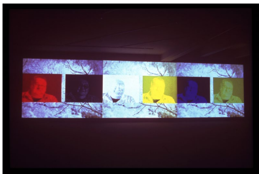
Installation detail, Dana Claxton